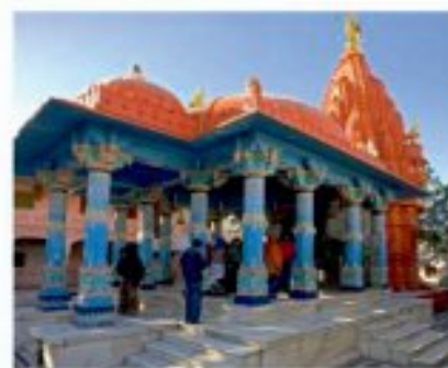
Brahma Temple, Pushkar