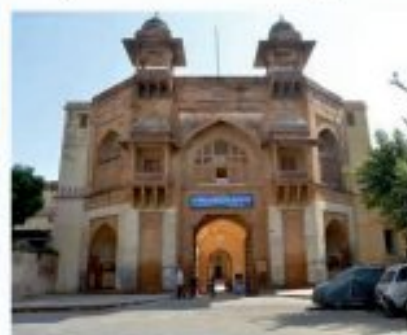
Ajmer Fort & Museum