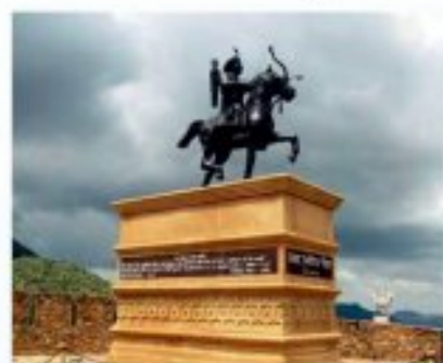
Prithvi Raj Smarak