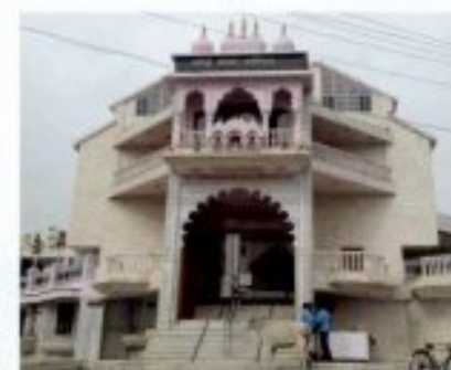
Sai Baba Temple