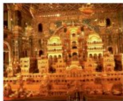
Soni Ji ki Nasiyaan