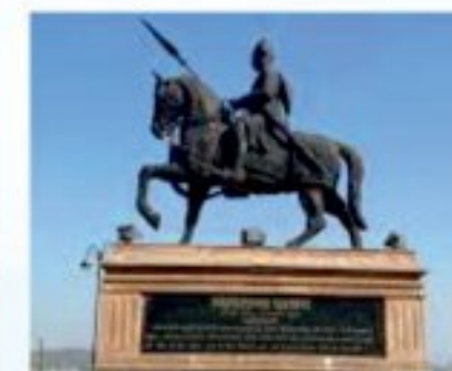
Maharana Pratap Smarak