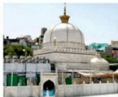
Ajmer Sharif Dargah